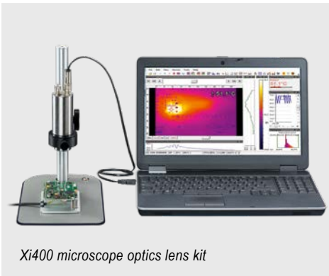
Xi400 microscope optics lens kit